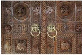
Saint Jovan Bigorski