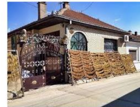
Macedonia That Are Not Skopje or Ohrid...