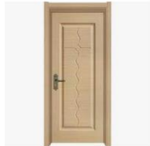
Wooden Doors - Wooden Vene... pinterest.com