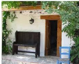
Traditional stone house in a listed ... pinterest.com