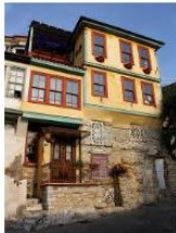
GREECE CHANNEL ]... pinterest.com