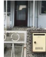
Vintage House Door E... shutterstock.com