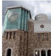
Cole & Grady's Travel Bio... colegrady.blogspot.com