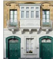
Malta, Malta gozo, Malt... pinterest.com