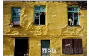
Central Macedonia ...