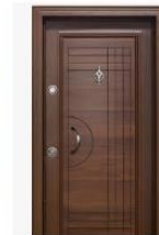
Wooden Doors - Woo... pinterest.com