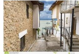
Street Alley Passage With Old House ... dreamstime.com