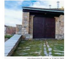
Royalty Free Traditional Macedo...