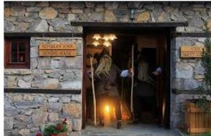
Macedonian Village Resort – Where the ... travelling-macedonia.blogspot.com