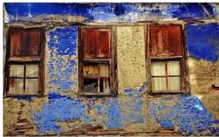
Windows in Macedonia | Makedonsko ...