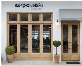
Hotel, hotels Halkidiki (Chalkidiki ... pinterest.com