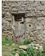
Traditional House Villa...