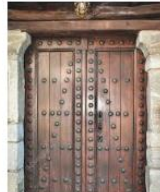
vecchia tradizionale co...