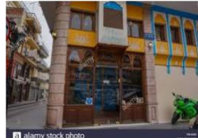
traditional old houses at Barbuta ... alamy.com