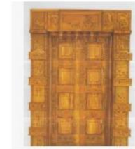
Antique Wooden Door Exp...