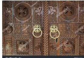
Saint Jovan Bigorski Stock Photo ... shutterstock.com